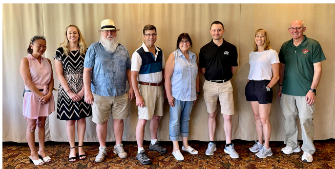
Twin Cities PCC Board Members