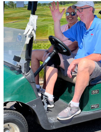
2022 Twin Cities Golf Event