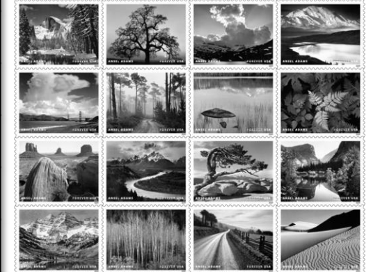
Ansel Adams Forever Stamps 2024

** First Class Mail International Letters and Cards 1 ounce price. Inbound prices set by UPU, expected increase 5.8%.